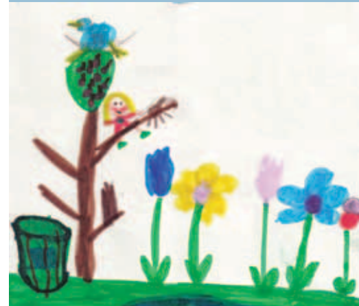
ILLUSTRATION BY KATIE SANTOS

Ecojustice is committed to the use of environmentally responsible papers. By choosing 100 per cent post-consumer recycled fiber instead of virgin paper for this printed material the following savings to our natural resources will be realized this year.